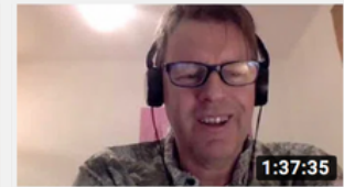
93 Global Peace Work Alyn Ware

https://www.youtube.com/watch?v=lqS9XJthnN8