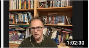
91 Beckwith After COP 25 Paul Beckwith

https://www.youtube.com/watch?v=ao0O_cs2YuQ